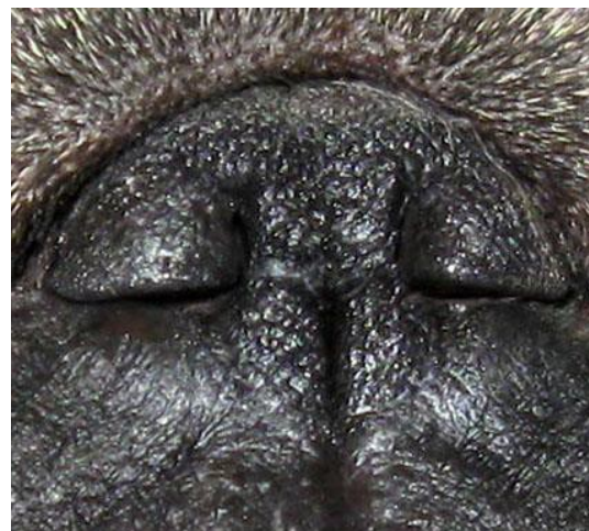
Grade 3 = severe stenosis

(Grading as in Liu et al. 2016. Photos: Liisa Lilja-Maula)