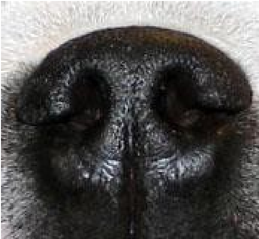
Grade 0 = open nostrils