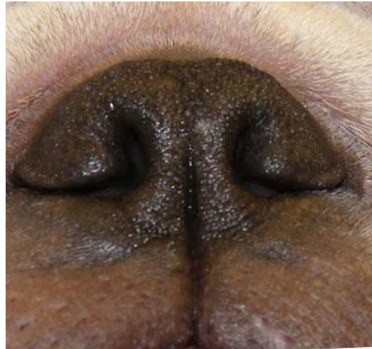
Grade 1 = mild stenosis